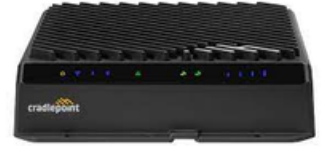
R1900 Ruggedised In- Vehicle 5G router