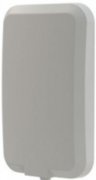
Panorama 4x4 MIMO Directional Panel Antenna