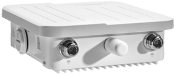
W1855 5G Wideband Outdoor Adapter