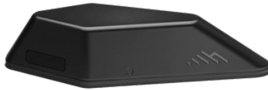
R2100 Ruggedised 5G vehicle router