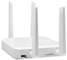
W1850 5G Wideband Indoor Adapter