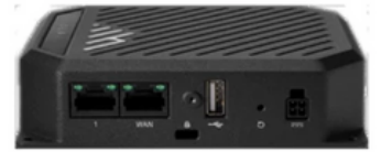
s700 versatile semi- ruggedised IOT router