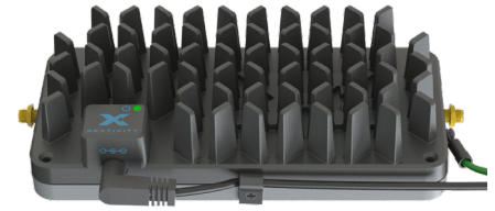
CEL-FI ROAM R41