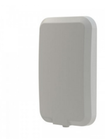
Panorama 4x4 MIMO Directional Panel Antenna